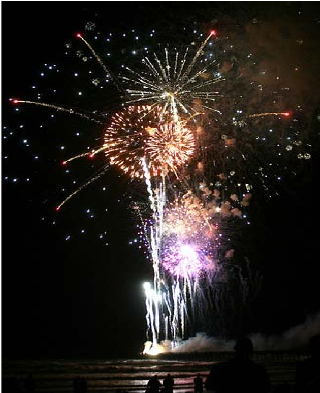
Fireworks display in Jacksonville Beach